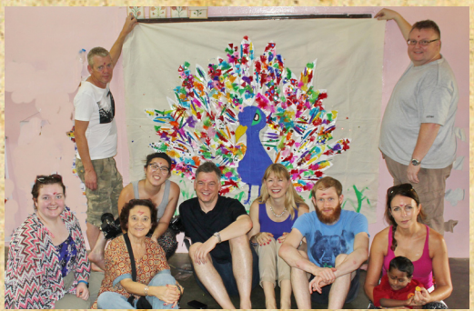
PCTC - Celebrating 25 years of journey with the people